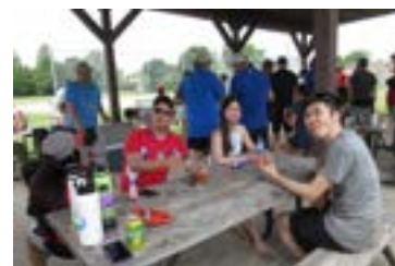
Players and Guests attending the June 22 BBQ.