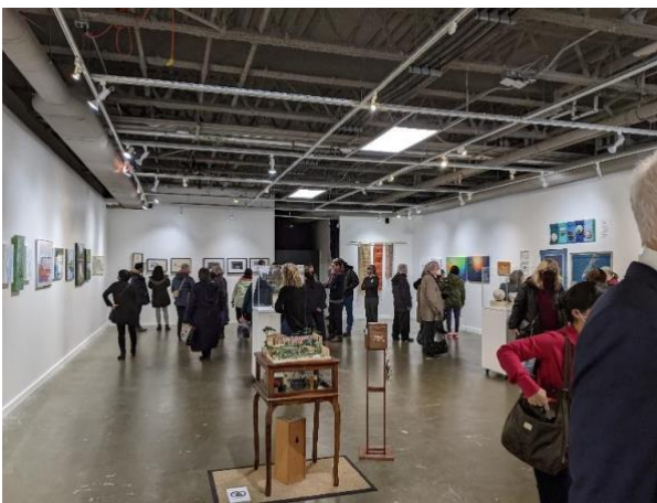
Community Exhibit “Artsu Matsuri”