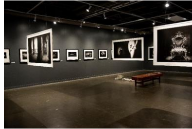
Shin Sugino Déjà Vu