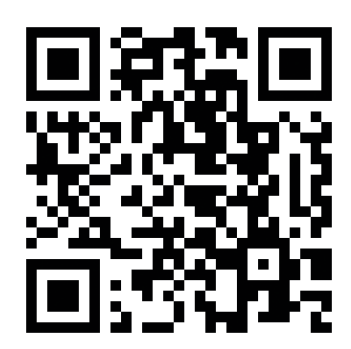
Cultural Class Registration