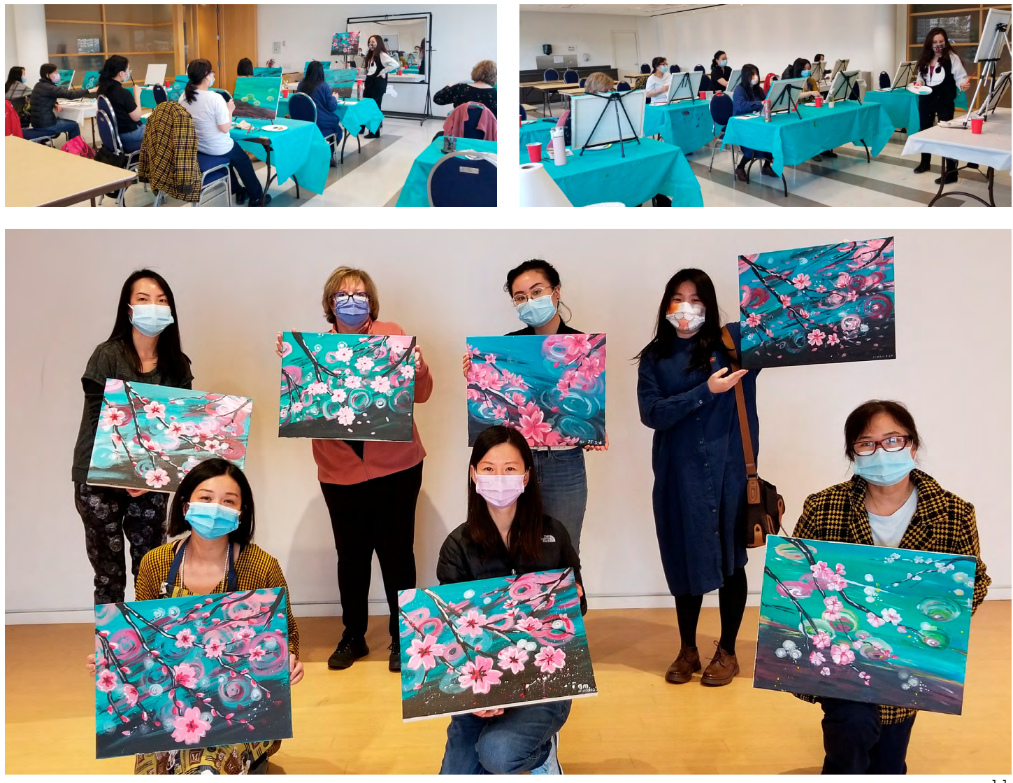
APRIL 2022 VOL. 48 ISSUE 4

We are hopeful next year will see a return to a more normal in-house festival. Mark your calendars for the first weekend in March and we'll see you then.