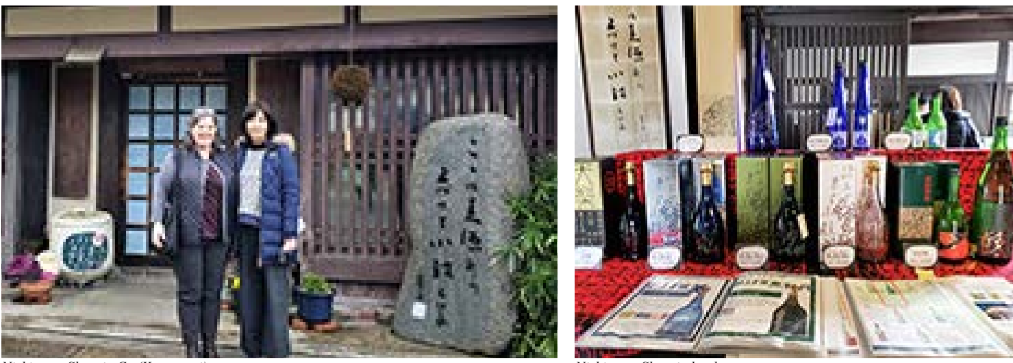
Nishivama Shuzojo Co (Kotsuzumi)

themselves to different temperatures for