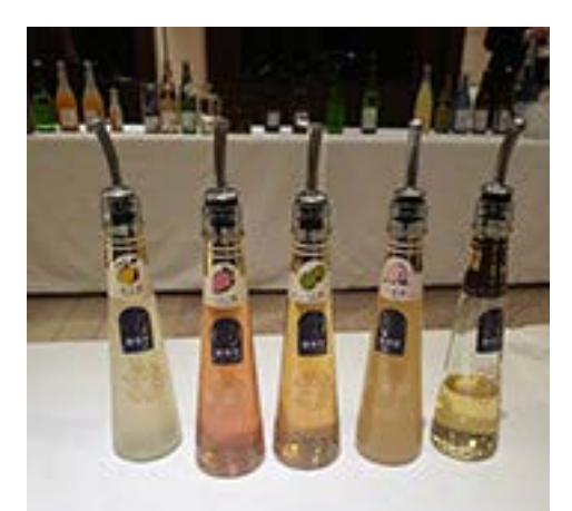
Kobe Reception fruit sake

**The next installment will focus on Winter Water – Kvoto.