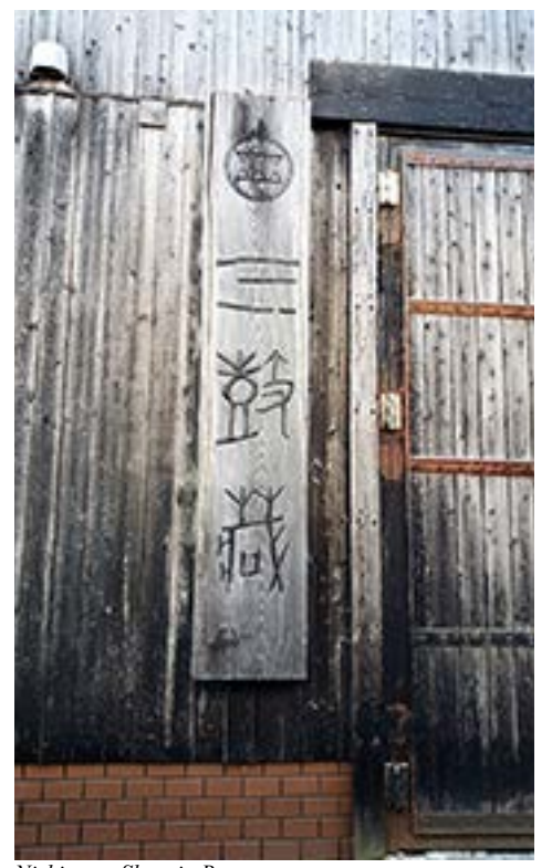
Nishiyama Shuzojo Brewery

In the spirit of Multiple Parallel Fermentation (to be explained later) this storyline will attempt to simultaneously weave elements of people, places and things together to relay to you my recent experience in Japan. Before Christmas, my agency (Amethyst Wine Agency) was invited by JETRO (Japanese External Trade Organization) to apply for an opportunity to tour two Sake brewing regions on the island of Honshu. What a gift -- one that ended up having many layers to it that I gleefully kept opening as each experience polished my knowledge about Sake down to the pearls of wisdom that I have taken home with me to Canada. The entire trip was smoothed out by good fortune during a time that was becoming very turbulent for the world with the advance of the novel coronavirus. My flight from Toronto to Tokyo then on to Osaka happened on February 17th, when the only notable cases in Japan were on the Diamond Princess but people had already started to cancel their trips; so, each of the three airports that I travelled through were (sadly for the industry but good for me) empty. But wait, I did mention good fortune and many layers. Let me give one of the first layers now: after being accepted to visit two brewing regions in Kansai, Hyogo and Kyoto, over the course of one week, I was then upgraded to join a second tour in Chugoku's San-in region that included the prefectures of Tottori and Shimane. Now, my trip was over two weeks and included four regions.