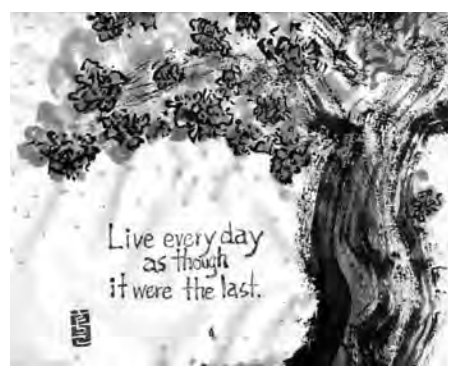
Etegami by Sachiko Hata-Pereklita