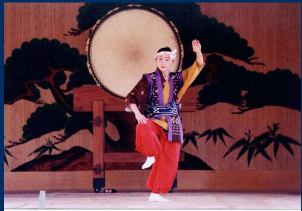
Tatsujin Gei with Nagata Shachu Concert 達人芸と永田社中コンサート

70th Anniversary of WWII Internment Conference 日系の歴史の遺産を語り継ぐ March Movie "Sword of Desperation" 3月映画鑑賞会:必殺剣鳥刺し